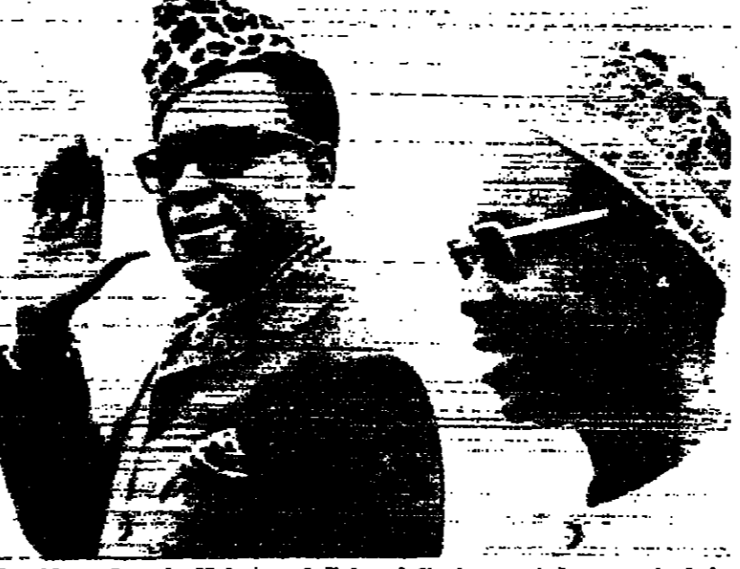
President Joseph Mobutu of Zaire, left, is greeted on arrival in Dar-Es-Salaam yesterday by Tanzanian President Julius Nyerere.